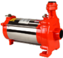
Open-well Submersible Pumps