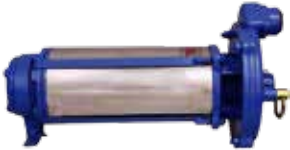
Open-well Submersible Pumps