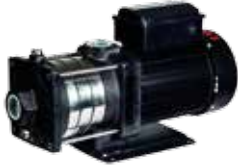
Horizontal Multistage Pumps